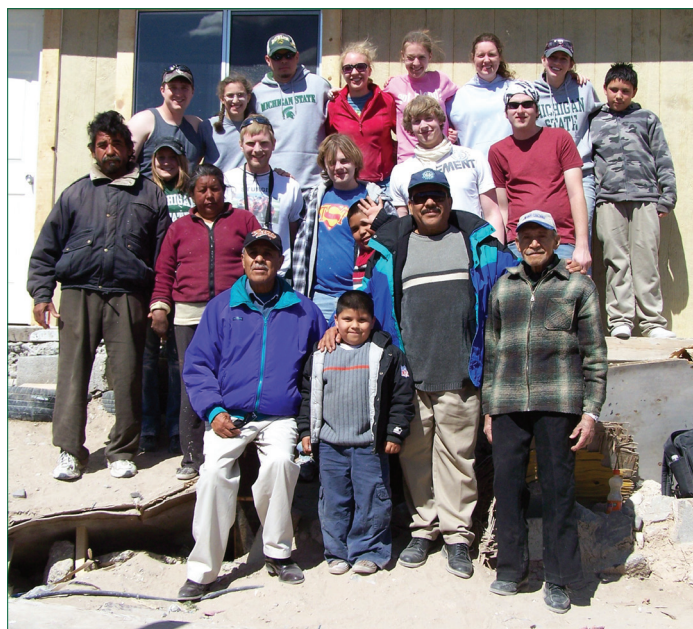
El Paso, Texas/Juarez, Mexico Spring Break Servant Event

College students work with the Central America Lutheran Mission Society.